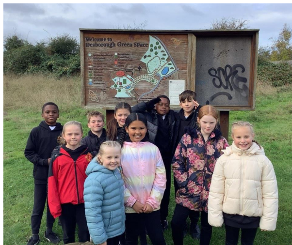
2 - Our fantastic cross-country runners