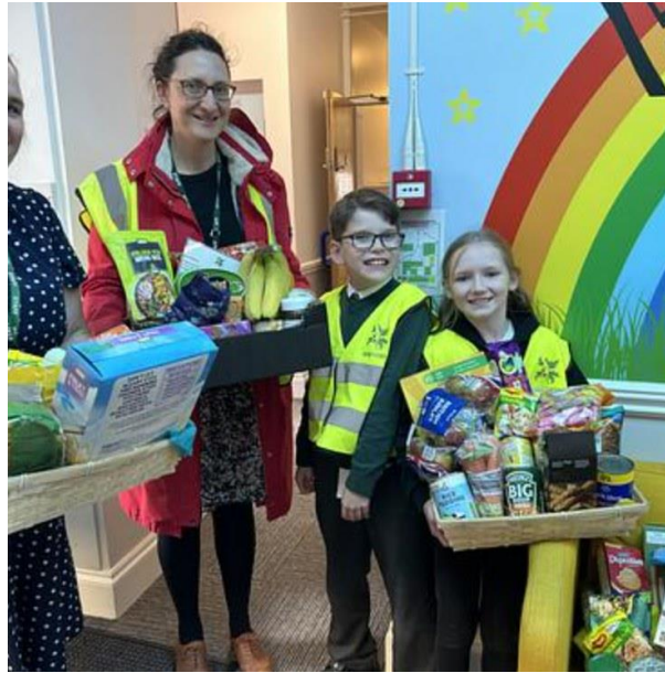
1 - Harvest Hampers