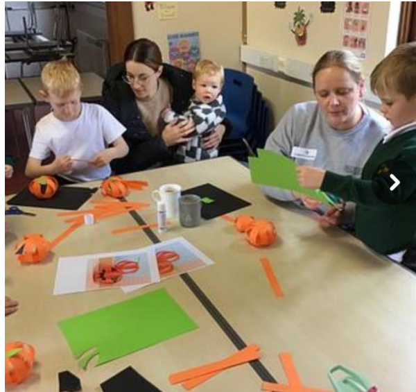
3 - Autumn Coffee and Crafts session