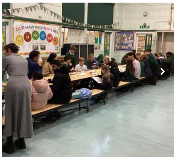
1 - Toast & Tales