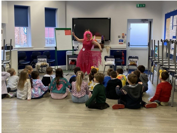
1 - Anti-bullying workshops with The Big Bubble Theatre